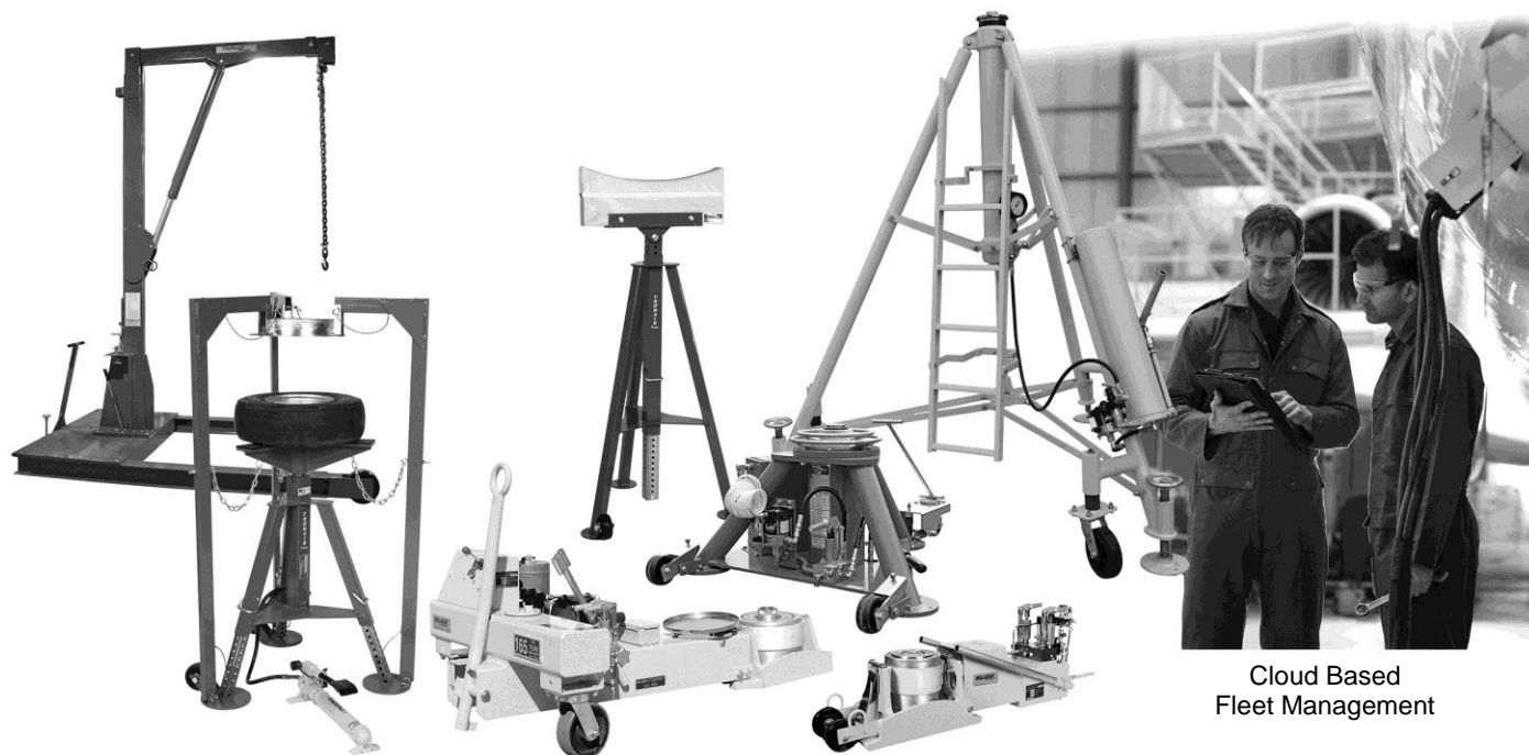
Cloud Based Fleet Management

The Tronair Family of Ground Support Equipment and cloud based EBis GSE Fleet Management