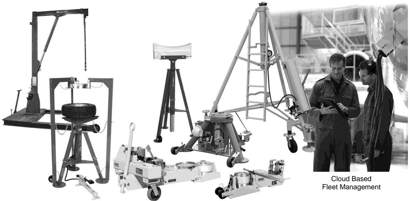
Cloud Based Fleet Management

The Tronair Family of Ground Support Equipment and cloud based EBis GSE Fleet Management